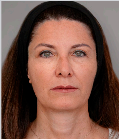
24 Months After ELLANSÉ-S