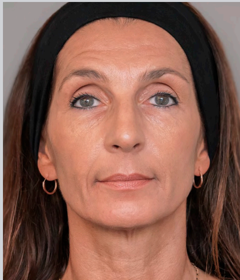
24 Months After ELLANSÉ-M