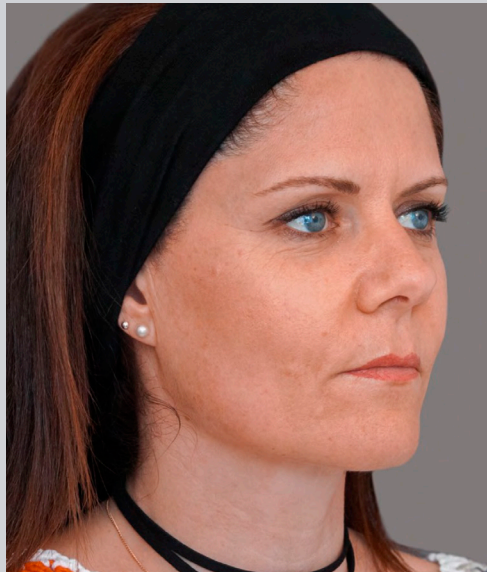
24 Months After ELLANSÉ-M