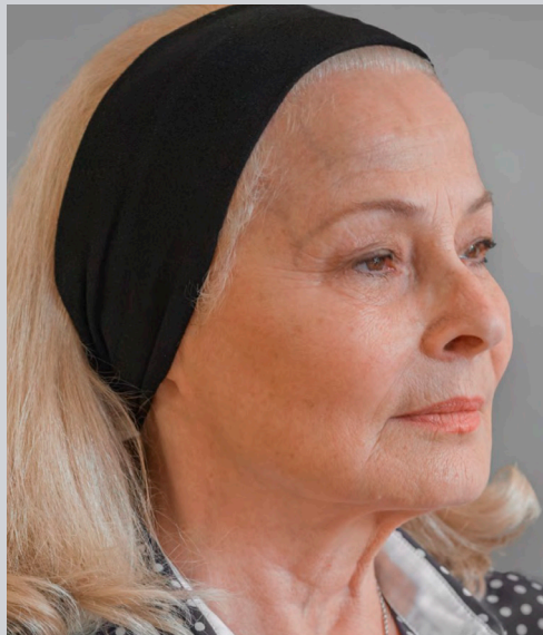
12 Months After ELLANSÉ-M