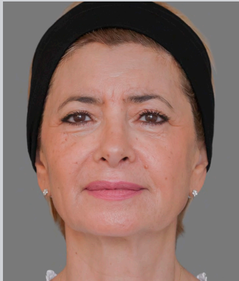
24 Months After ELLANSÉ-M