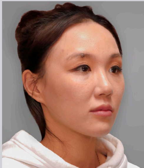
14 Months After ELLANSÉ-S