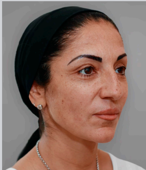
12 Months After ELLANSÉ-S