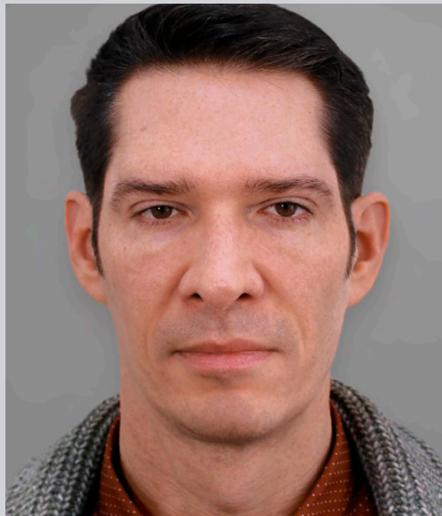
12 Months After ELLANSÉ-S