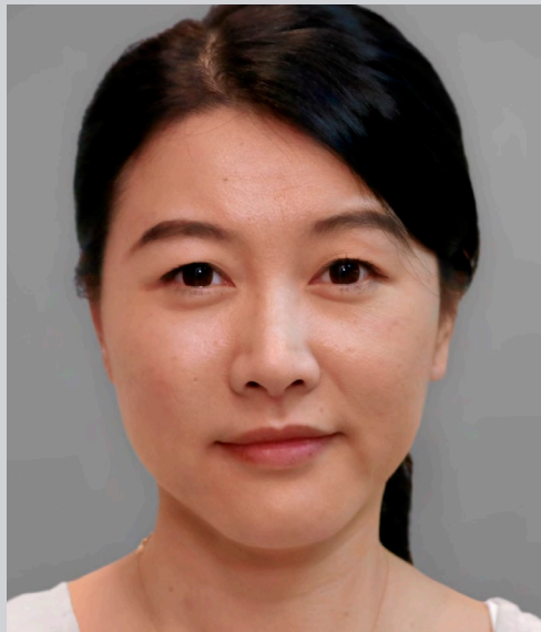
20 Months After ELLANSE-S