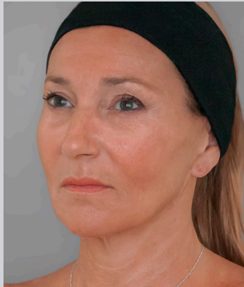
24 Months After ELLANSÉ-M