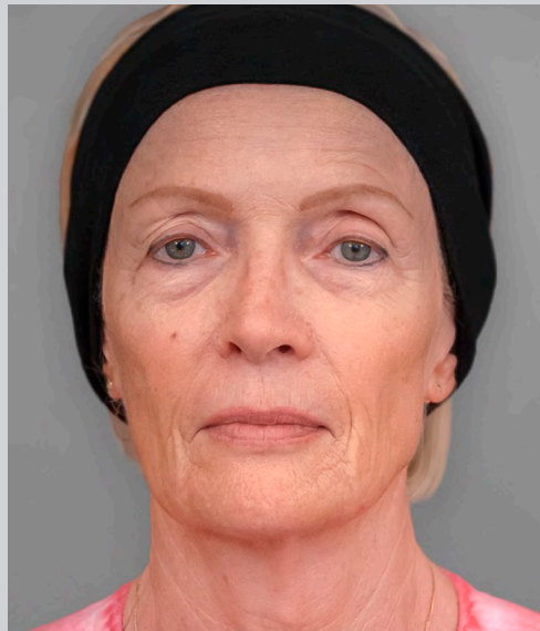
24 Months After ELLANSÉ-M